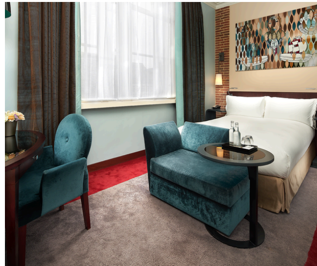
Classic Room - 435

All 178 guestrooms are individually decorated, using natural tones such as beige, lilac and cream and materials like mahogany, marble and steel, some with typical Dutch classical-style brick walls. The interior was designed by the well-known French architect Sybille de Margerie, who collaborated on the design of the rooms with nine students from the renowned Design Academy Eindhoven. Works by the Dutch 'Droog Design Group' have also been incorporated into the interior design; functional furniture, presented as a 'piece of art'.