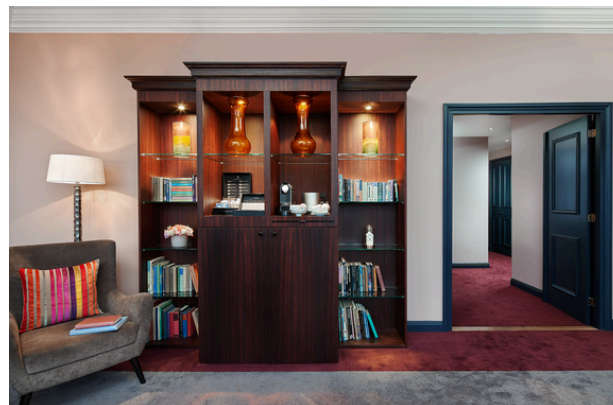
Canal House Suite - 741