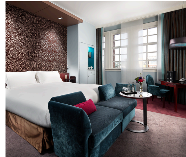
Luxury Room - 446