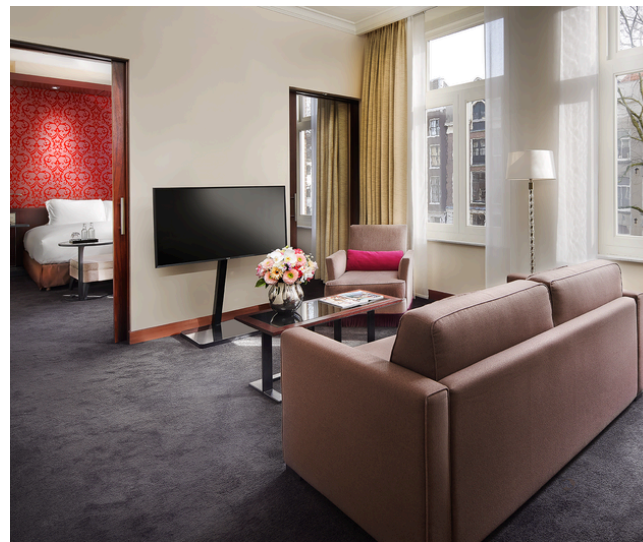
Prestige Suite - 202

The Grand has 30 suites in total, ranging from Prestige Suites and Opera Suites to the highly exclusive Imperial Suites and Royal Suite. For the design of the Imperial Suites, Sybille de Margerie drew inspiration from the legendary people who stayed at The Grand, resulting for example in the William of Orange Suite and the Maria de Medici Suite. The result is a harmonious blend of traditional and contemporary design features, including typical Dutch style elements. Needless to say, the suites are also fully equipped with the latest technology and features. The suites are regularly visited by heads of state, celebrities, artists and ambassadors from all around the world. Guests feel privileged to stay at these unique locations, steeped in history and infused with memories of a distant past.