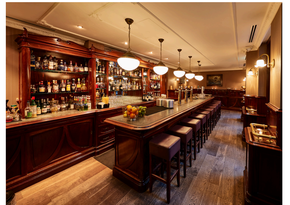
The Flying Dutchman

The conviviality – or gezelligheid as the Dutch like to say – of traditional brown cafes are playing an important role within the Amsterdam culture. These places are pre-eminently the places where known and unknown guests come together for over centuries. This also counts for The Flying Dutchman.