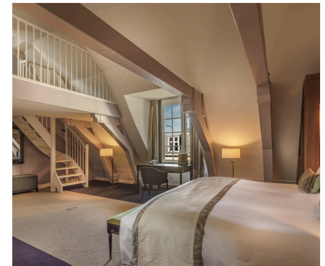
Royal Suite - 713