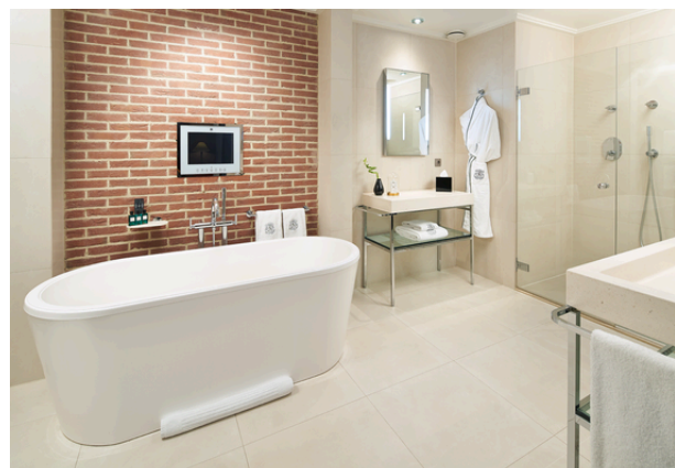
Bathroom - 741