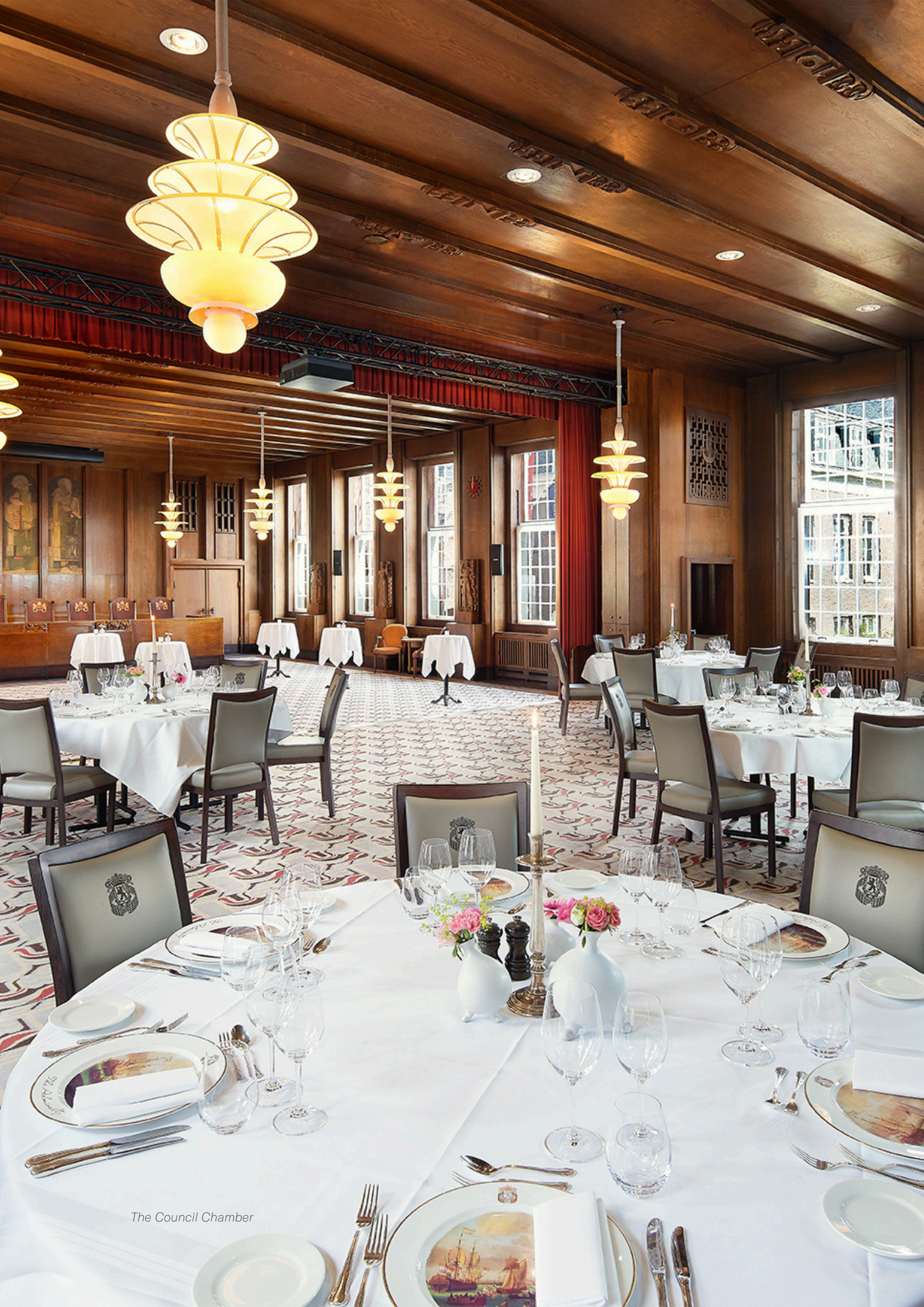
The Council Chamber