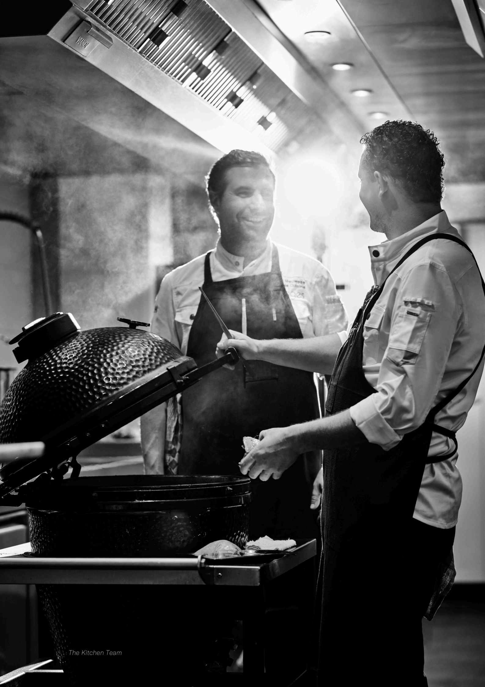
The Kitchen Team