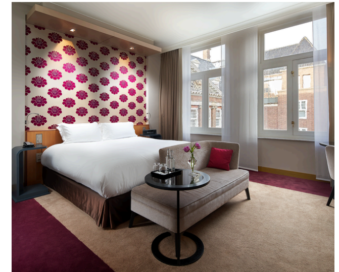
Junior Suite - 301