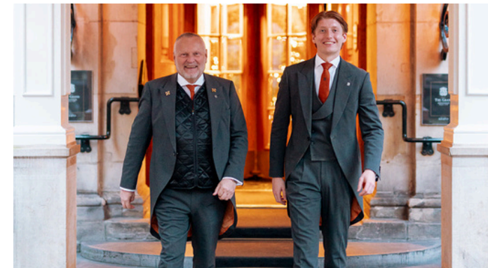
Les Clefs d'Or

The 'Le Clefs d'Or' Concierge-team holds the keys to Amsterdam and is delighted to assist with booking tickets, making reservations and ensuring a carefree stay. Also, the Concierge will be happy to assist in arranging transportation; an airport limousine service is available for pickup. Valet parking is offered seven days a week.