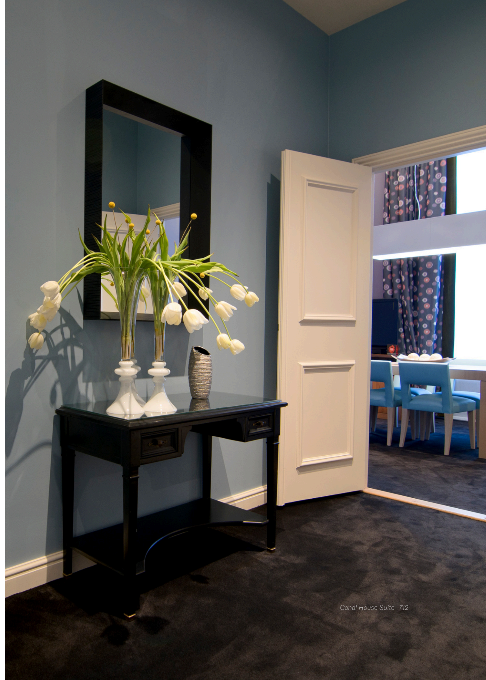
Canal House Suite - 712