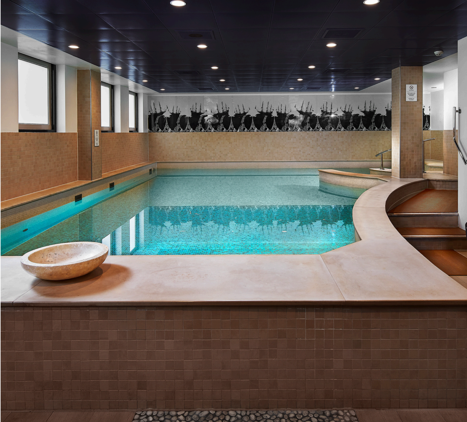
The Pool at Sofitel SPA