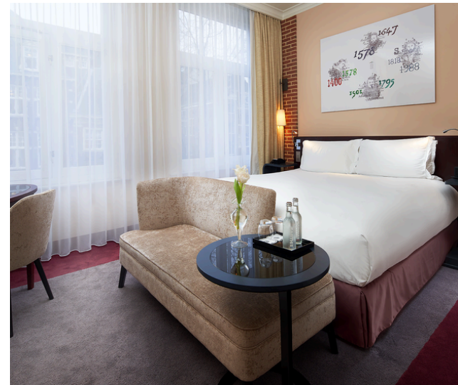
Superior Room - 208