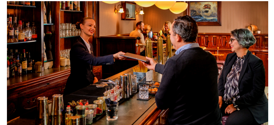
The Flying Dutchman

With the warm and inviting ambiance of this traditional brown café, The Flying Dutchman is the place in the historical heart of Amsterdam where everyone feels at home.