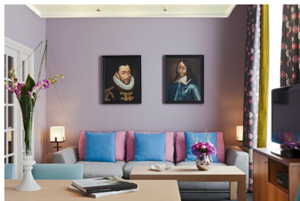
Canal House Suite - 712