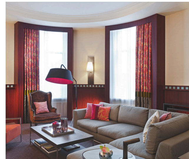
Willem of Orange Suite - 424