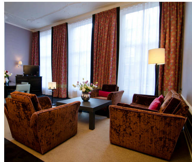
Opera Suite - 715