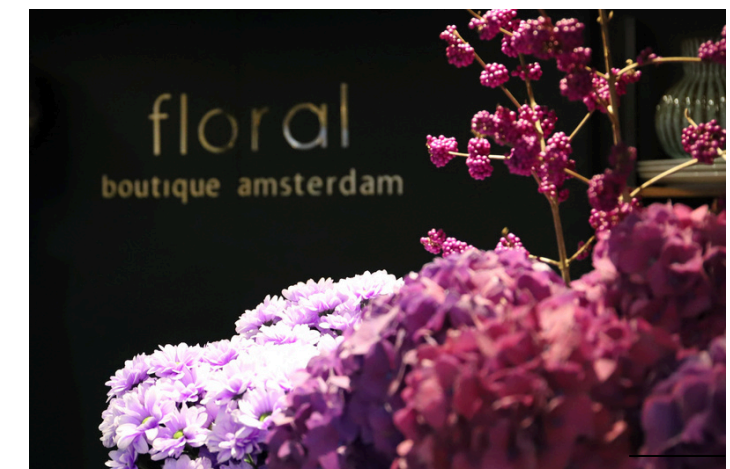
The Floral Boutique

As a historical five-star luxury hotel in the heart of the city, Sofitel Legend The Grand Amsterdam is dedicated to providing exceptional service while maintaining the highest standards of environmental sustainability and social responsibility. The Grand actively implements and prioritises environmental, social, and governance principles.