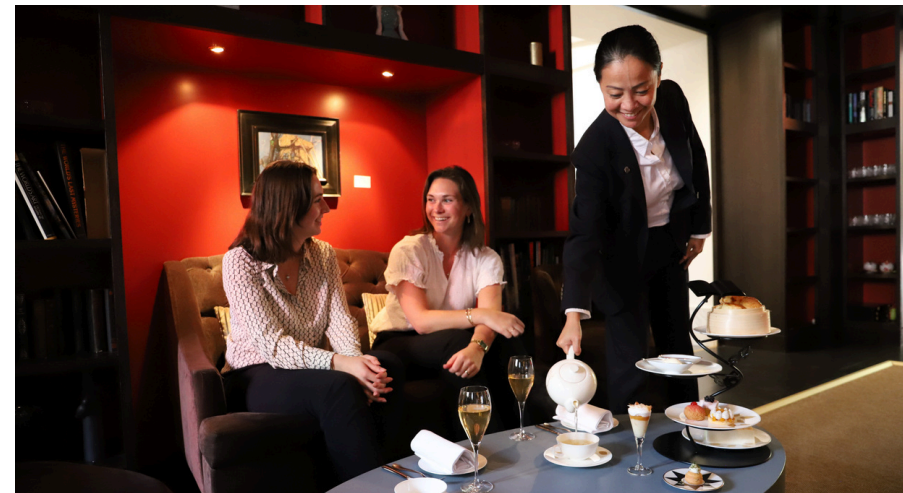
The Grand Afternoon Tea

The Library 'Or' was designed by interior designer Sybille de Margerie, who drew inspiration from the colors of typically Dutch elements, such as the dark-grey street stones known as 'klinkers' and the deep, rich colors of the Amsterdam flower market. Dotted around the library are comfortable sofas and deep armchairs, where one can relax or partake to The Grand Afternoon Tea.