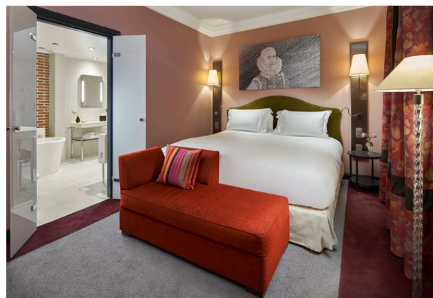
Canal House Suite - 741