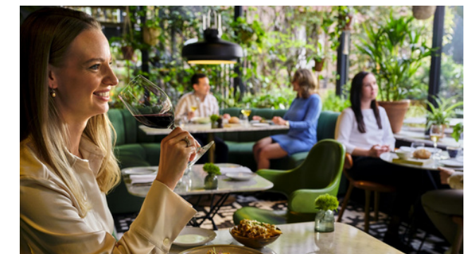
Oriole Garden Bistro

With its inviting vibe, Oriole is the perfect place to enjoy a light lunch, cosy dinner with family and friends or the Mediterranean tradition Aperitivo. Combine the pure dishes with Oriole style cocktails that will take you to the Mediterranean in the heart of Amsterdam. Made with fresh ingredients grown on our rooftop garden, our talented bartenders are ready to shake!